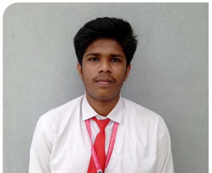
MASTER MERUL -XII NEET

The Vijay Millennium School stands proudly in its modern architecture which is a beacon of innovation. Within its walls, young minds blossom, nurtured by visionary educators. As morning sunlight streams through sprawling windows, the campus comes alive. Students burst with enthusiasm, their laughter echoing their corridors.